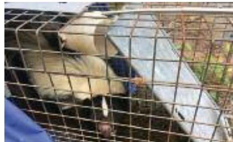
Above, rescued in Clark, top right in Rahway, right, in Lacey Twp.

July was surely a busy month for rescuing skunks in trouble! Within a week, ACO Jesse McNamee was dispatched to rescue two adolescent skunks who were stuck in residential fences. Called in by good Samaritans, both skunks were rescued, examined, and released safely back into their habitats.