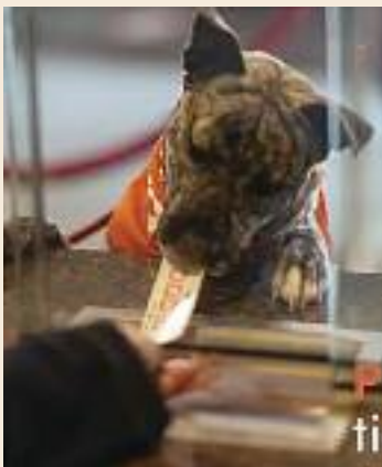
STILL FROM VIDEO COURTESY: NJPAC and VIDEOGRAPHER: DANELGOVISON

Newark shelter pup Bluebell demonstrates pawless (hands-free) ticketing. She was adopted shortly after the video was filmed.