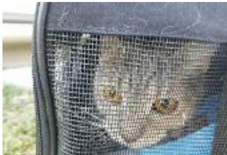
Alone and terrified, Zara luckily had the help of a good Samaritan who called AHS.

The beautiful silver-grey tabby we've named Zara was left at the edge of the road in her carrier. Inside were some tee-shirts, food and water, but what she didn't have is someone to bring her to the safety of our shelter.