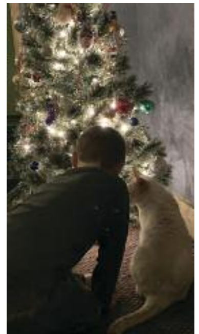
Celebrating Lunar's first Christmas together in his new home.