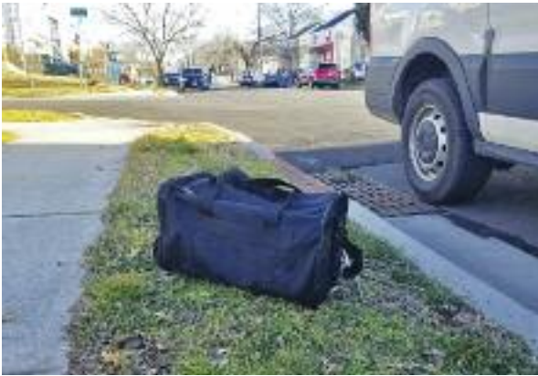
Zara was inside the carrier above, left near a children's playground and subject to any number of possible fates.