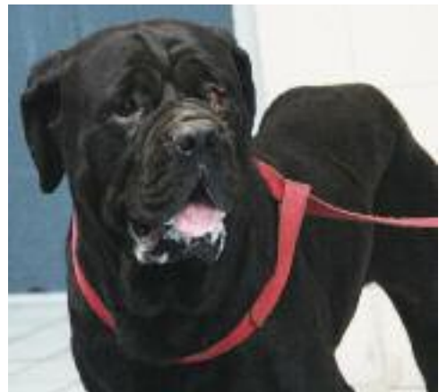
Mimi, two months after she began treatment at AHS. It's been a slow, but steady road and she's doing better all the time.

Mimi's recuperation continues at our AHS/Popcorn Park facility and once recovered, she'll be looking for the best home ever. Check online at ahscares.org to see her latest video. Contact 609-693-1900 or email: office@ahsppz.org for more info on Mimi and refer to File#39201-F (Forked River)