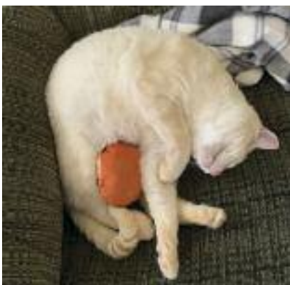
Napping with a favorite toy ...

Lunar was surrendered to us last September, a senior at 10 years old, his owners no longer able to care for him. The poor guy just couldn't figure out what he did to deserve being taken away from his home and brought to an unfamiliar place, but we made him feel right at home. We also got him the medical care that he needed, since he had some neglected teeth and such.