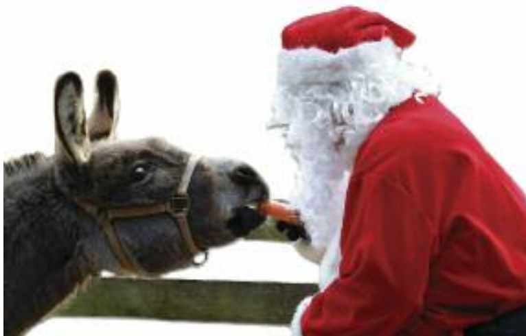
Jezebel got her favorite treat from Santa, who gently hand fed her, too!