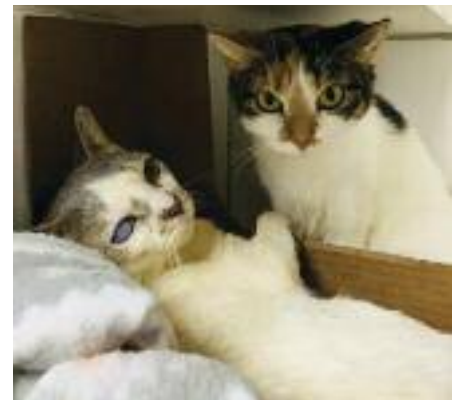
Two of the rescued 22 cats, now enjoying a state of health never before known. Another, below, after a long bath and in the safe arms of staff.

Some of the cats are now available for adoption and will need calm homes where security is provided. For adoption of one of these kitties, please contact Lindsay at: lindsay@ahsppz.org