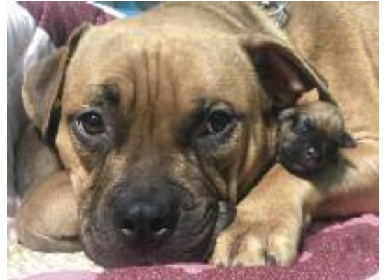
Tessie has proven herself to be a wonderful mom to her pups despite all the trauma she's endured.

And by the looks of her, one of fear, as well. She had bite marks all over her from the three male dogs she lived with, but a thorough medical examination of Tessie revealed so much more than just bite wounds; she was anemic due to a severe flea infestation; dehydrated from chronic diarrhea; and had terrible ear infections. She was so scared and weak, she needed to be carried in and out to use the bathroom. To top it all off, Tessie was pregnant. Tessie had a lot to contend with, but she was clearly happy to be cared for and to be getting lots of attention from her new friends.