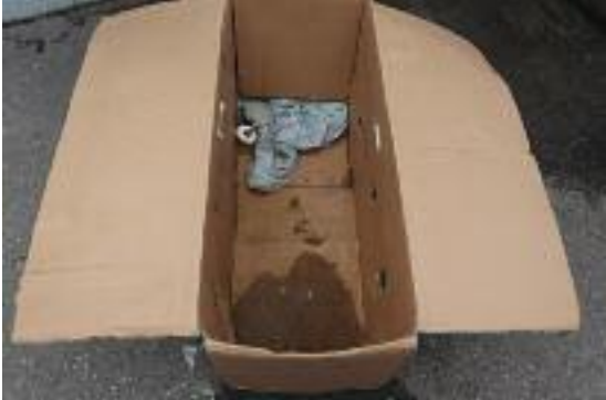
The box in which two elderly, helpless dogs were abandoned - luckily, found by staff.

It was a hot, humid, rainy day when an employee found a filthy box with two aging Pugs inside in need of immediate care. The confused, frightened lasses were in sad shape. They were covered in feces & urine with nails so overgrown that they curled around. Molly (black) is missing an eye and both girls have severe arthritis and chronic dry eye – neither of which was being treated. Their teeth were falling out during a medical examination, plus Lucy (fawn) and Molly both suffered with ear infections. After their veterinary exam, their second stop was the grooming van for a long, relaxing spa day. They took a nap while the filth and grime of their past life was washed away from them.