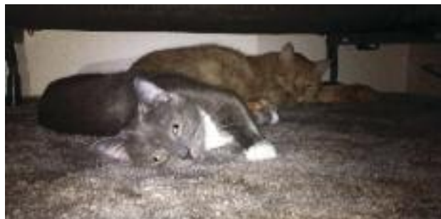
Taking a break with her buddy under the furniture.