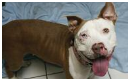
Iris in October, showing great progress in her healing.