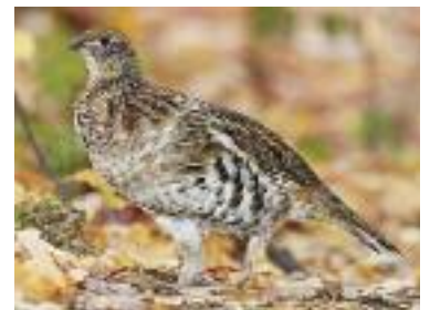
RUFFED GROUSE

The Interior Dept. has opened 2,200 square miles on 77 national wildlife refuges across the country to hunters & fishermen. The area is considered critical habitat for waterfowl & other birds to rest & refuel during their migration. Hunting & fishing will be allowed at 7 national wildlife refuges for the first time & expanded 70 others. Some 5,000 regulations have been eliminated or simplified to match state rules.