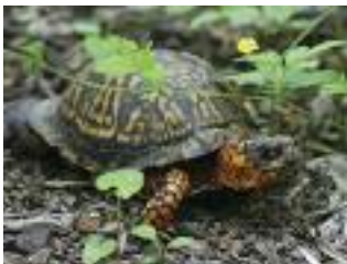
EASTERN BOX TURTLE

William T. Gangemi of Freheold, was accused of violating a federal law against the sale or purchase of illegally collected wildlife with a market value of over $350. Gangemi was part of a syndicate of wildlife smugglers involved in the purchase & transport of 3-toed & western box turtles from Oklahoma to NJ. Gangemi pleaded guilty & will be sentenced Jan. 27, 2020. Records show Gangemi was