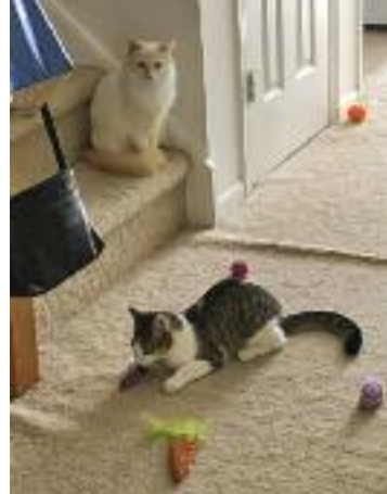
Foxy Roxy with one of her new sisters, learning to play and enjoy the toys she never had.

For more information, e-mail njhumane2@aol.com