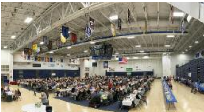
The RWJ Barnabas Health Arena was packed with over 700 attendees at our ever-growing annual Gift Auction.