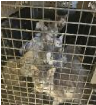
Above, one of the airline crates where the cats lived in filth, starving, and infested with fleas. Below, one of the cats - typical of the horrific condition of them all - on its way to getting a bath.

The scene was a nightmare ... multiple cats kept in airline crates with no water, very old cat food, & no litter pans. AHS was contacted to pick up 22 cats from the horrific hoarding case in Irvington -- a 3-family house with the mother living on the third floor & her son on the first floor with the cats. Our Newark ACO witnessed the pathetic animals slowly dying from a lack of water and food and from a massive flea infestation.