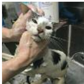
Staff provides a much needed cleaning for one of the kitties.