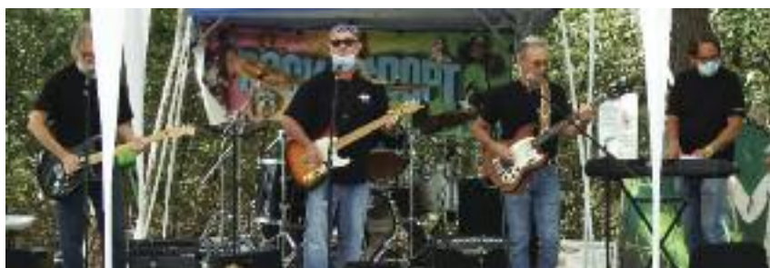
The Chardonairs, just one of the 19 bands who entertained guests over the weekend, played rock, funk rock, and southern rock from the 50's on.

It was a stupendous way to end a summer season at Popcorn Park with a weekend full of rock-n-roll and wagging tails! The park was filled with great music from local bands, solo artists, plus lots of laughs from special guests. Rock2Adopt was 9 Lives Strong with tons of talent and generous supporters, making this year the BEST YET with over $11,400 raised.