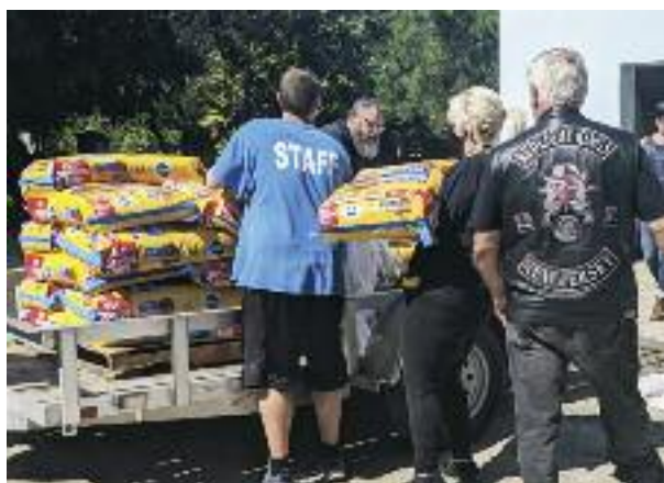
AHS staff and Redlight Kings unload the two donated pallets of Pedigree dog food into our storage unit.