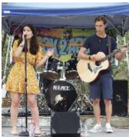
Sound of the Fury from Monmouth County played rock, pop, and blues for an appreciative audience.