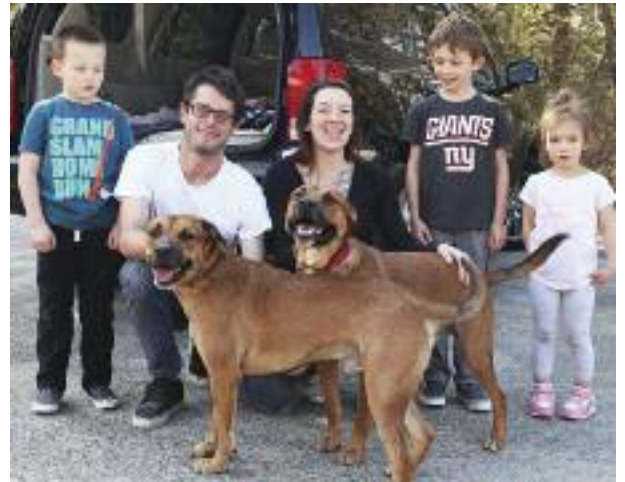
A happy portrait with Deuce and Simba and their new family.

in love with them. Check out the latest update: