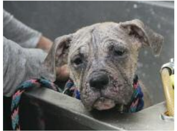
Twix being lathered up in one of many medicated baths to help soothe and resolve her dry and infected skin.

Transferred to our Tinton Falls facility to continue her recovery, Twix has her whole life ahead of her. With her calm, subdued personality, our staff will rebuild and renew her confidence to be the gentle soul whose aching heart is filled with love. File 48122-F (Tinton Falls).