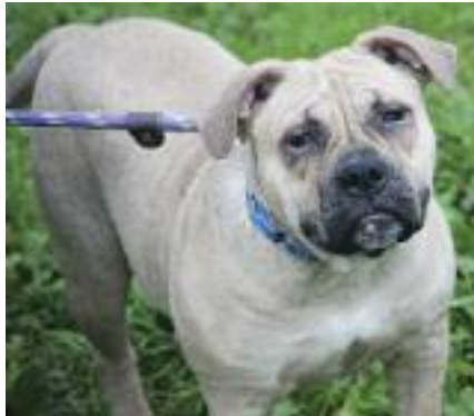
After a month of intensive treatment, plenty of good food and affection, the docile young lady was ready to continue her recovery at our Tinton Falls facility.