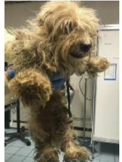
Many of the dogs were heavily matted; all were disgustingly filthy, and covered in urine and feces.

In another horrendous case of hoarding, our AHS Newark facility, once again, answered the call to Hillside, NJ to help the suffering animals that were owned by a woman who recently passed away. The animals were spread throughout two residences, and apparently, when this person's children went to the homes afterward, this is what they discovered.