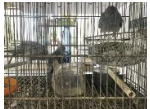
The 28 birds also lived in filthy cages with no food or water.

Back at our Newark facility all of the dogs were groomed by our wonderful groomer, Sandy. They were quite shaken up, but with good care, patience and affection they slowly came around. The cats were cleaned up and are being treated medically. The birds were transferred to clean cages, went to AHS/Popcorn Park, and completed their recovery. The dogs were sent to both AHS/Popcorn Park and AHS/Tinton Falls, while the cats remain in Newark. As we go to press, of an initial group, all dogs but one have found their forever homes; birds have been adopted or joined our aviary at Popcorn Park; and cats will be made available for adoption as they become ready.