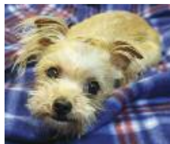
Ladybug, Andromeda, and Jelly were clean, groomed, and comfortable for the first time in a very long time and have all found loving homes.