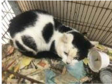
Some cats roamed free; others were kept in aging, feces-covered cages with no food or water.