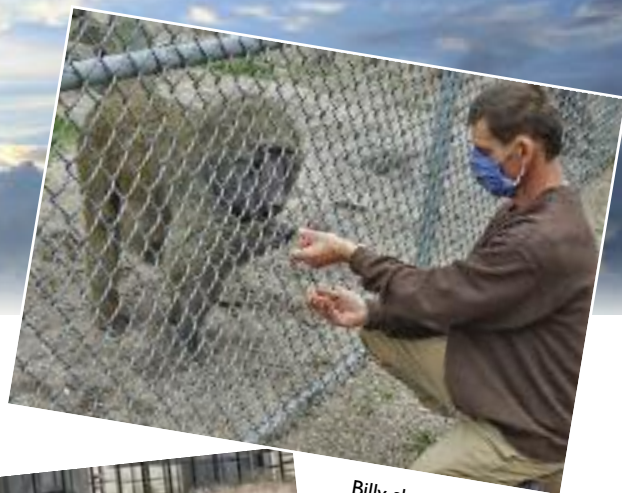
Billy shares a treat with Gandalf, one of our baboons.

Popcorn Park Refuge looks to a brighter day when we can open our gates once again - hear the poppers pop, the tigers chuff in delight to hear visitors call their names, and you can come and join us! `Til then - be safe.