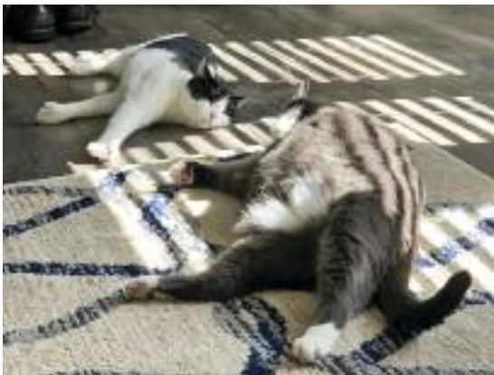
Two best friends enjoying naps in the sunshine ... does it get any better than this?

These two cats are having the time of their lives in their wonderful home! Blizzard (gray & white) and Eenie (black & white), had never met before coming to our facility, and came at different times. Eenie arrived at our facility in September, 2019, just three days before Blizzard was adopted!