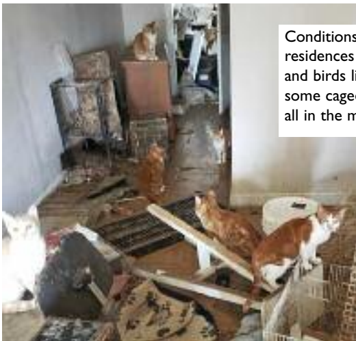
Conditions inside the Hillside residences were appalling - dogs, cats, and birds living in filth everywhere - some caged, some roaming about, but all in the midst of endless garbage.