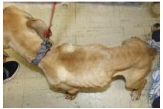
Above, Tyson's condition when he first arrived at our Newark shelter. At left and below a far happier, healthier boy!

Tyson was transferred to AHS/Popcorn Park to continue on with his recovery. Despite his unhealthy state, Tyson had a good appetite and began putting on weight immediately. He gained 15 pounds in the first month! Once he began feeling better, Tyson blossomed into a plump, happy, healthy puppy! He did have some serious neurological issues though, which our veterinarian spent a good deal of time evaluating. He has trouble placing his feet, focusing, and maintaining balance. (View his videos on our YouTube channel: Associated Humane Popcorn Park Shelter). Extensive testing all came back negative, therefore it has been determined that Tyson likely has cerebellar hypoplasia. A very special home would be needed for young Tyson, where he would be kept safe and given all of the patience, love, and understanding that is needed in order for him to live a full and happy life.