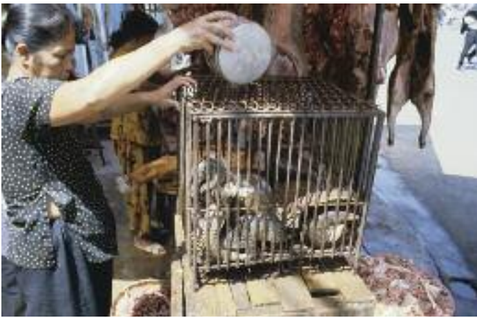
A woman pours water on a cage crammed with pangolins at a "wet market" in southeast Asia. Hanging nearby, in the open air, are the carcasses of numerous slaughtered animals for sale.

In the midst of this public health crisis, we are reminded of how much we all depend on each other. The AHS/Popcorn Park continues to live up to our mission -- we're doing our part to prevent the spread of the coronavirus and provide the best of care to the many animals in our care.