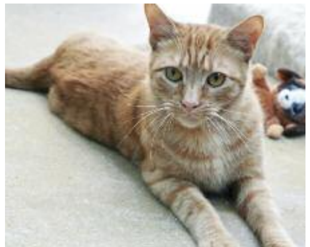
Niko looks forward to attention and anyone with a camera. Soon he'll be looking forward to a loving home with you!

After Niko has recovered from his procedures, this incredibly happy, hammy guy will be looking for