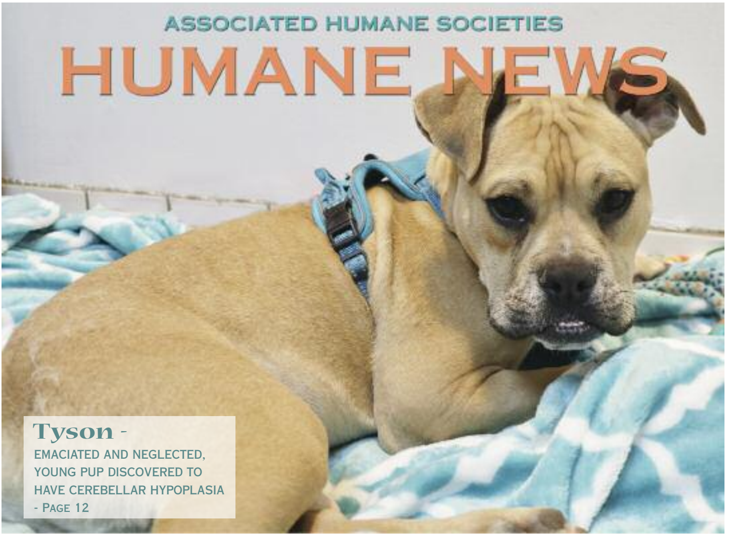
Tyson - EMACIATED AND NEGLECTED, YOUNG PUP DISCOVERED TO HAVE CEREBELLAR HYPOPLASIA - PAGE 12